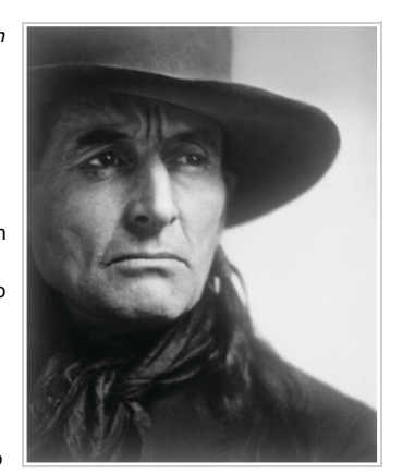
Portrait of Grey Owl (1936), by Yousuf Karsh

I have always felt a deep respect to North American aboriginal people, the true landlords of this continent, who had lived in full harmony with Mother Nature before we Europeans set foot on it.