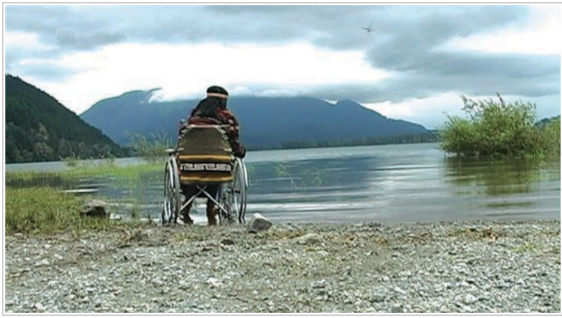
Still from the movie.

While the aboriginal woman's story is always adorned with deep rich colour, the white woman's story is typically adorned with a bland, lifeless and disturbing lack of colour.