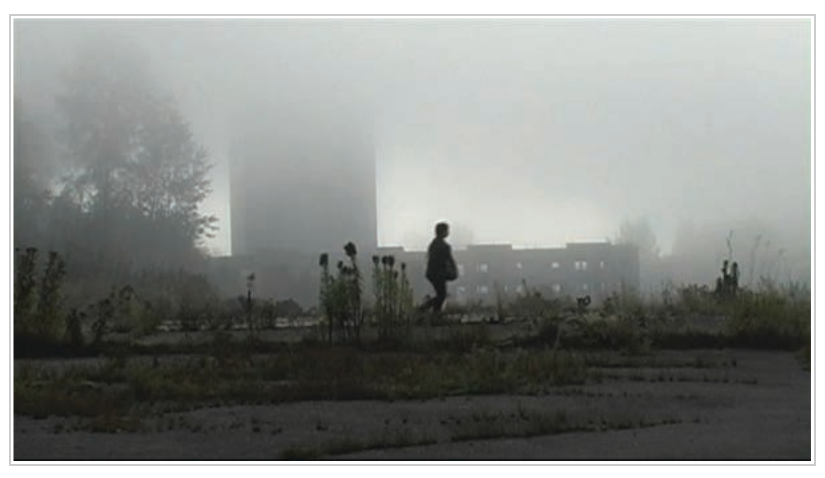
Still from the movie.