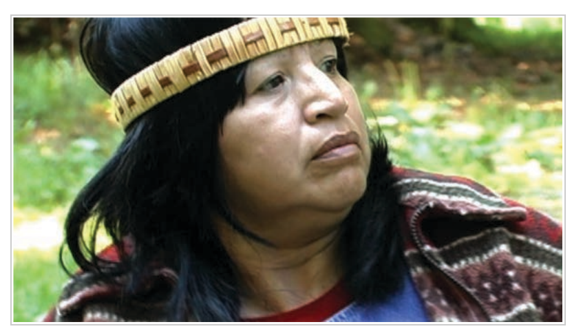
Still from the movie (Keneesh-Brenda)

In her increasingly hurried and unsettling path through the modern world the white woman walks through a bleak landscape, usually surrounded by a thick fog, filled with industrial wreckage, broken buildings, piles of wrecked cars and other debris of the modern city.